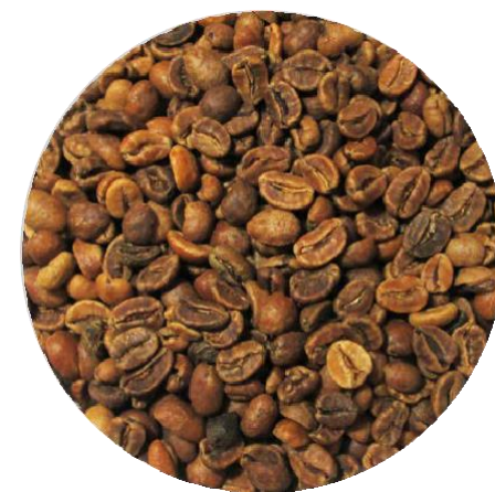
Gayo And Mandheling Wine