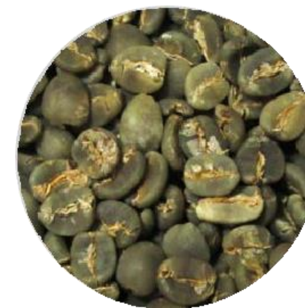
Bali Kintamani Grade 1