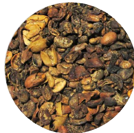
Mandheling Low Grade