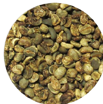
Mandheling G3 Special