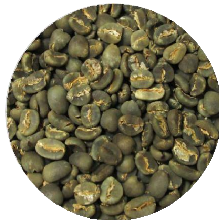
Mandheling High Grade