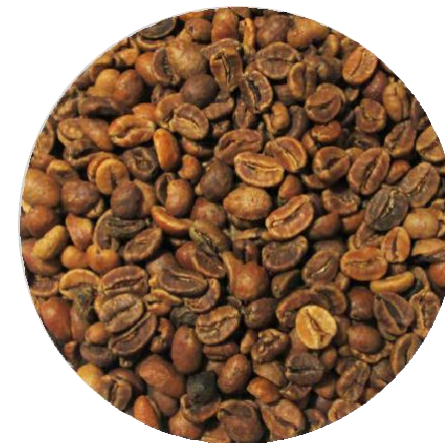
Gayo And Mandheling Wine