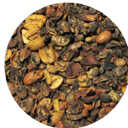
Mandheling Low Grade