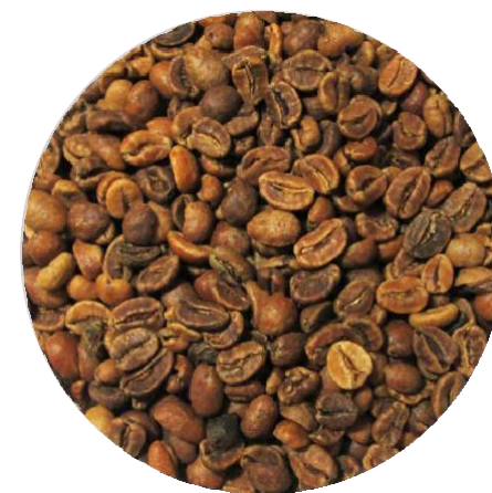
Gayo And Mandheling Wine