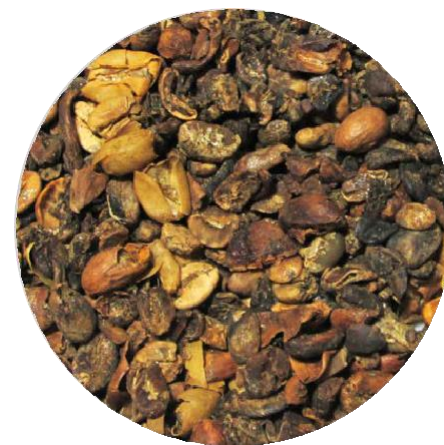
Mandheling Low Grade