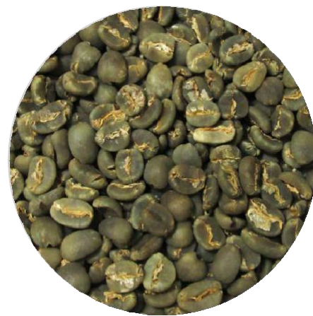
Mandheling High Grade