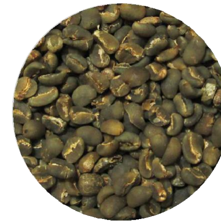
Toraja Grade 1