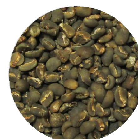
Toraja Grade 2