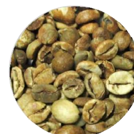
Bali Kintamani Robusta ELB 350BC