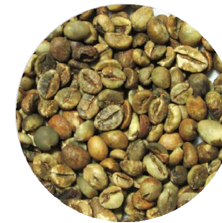
Lampung Elb 450 Bc