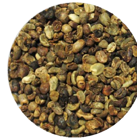
Mandheling Grade 5