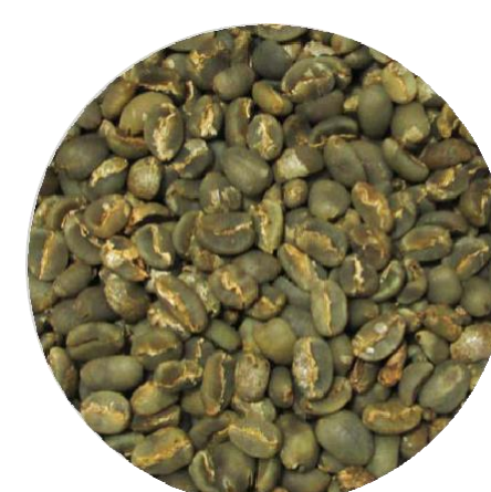
Java Ijen Grade 1