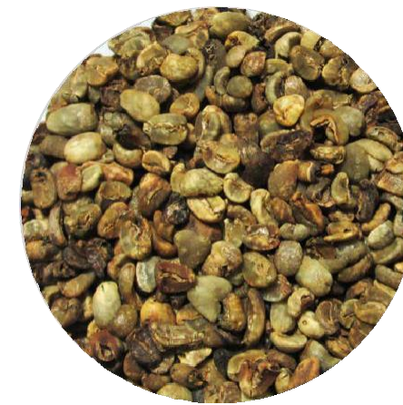
Mandheling Grade 4