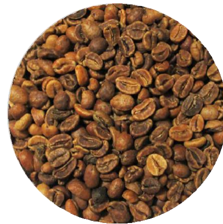
Gayo And Mandheling Wine