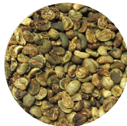
Mandheling G3 Special