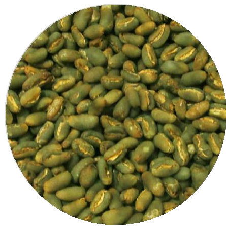
Sumatra Super Peaberry