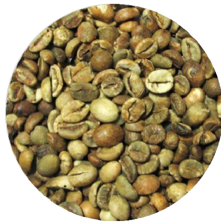
Lampung ELB 350 BC