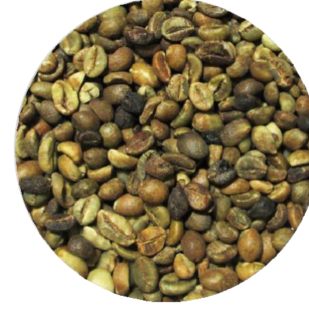
Sidikalang Grade 3