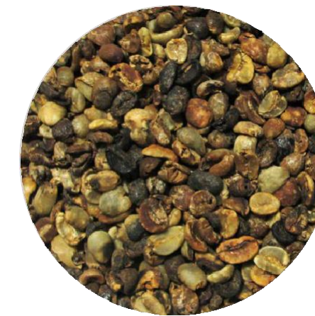
Mandheling Grade 6