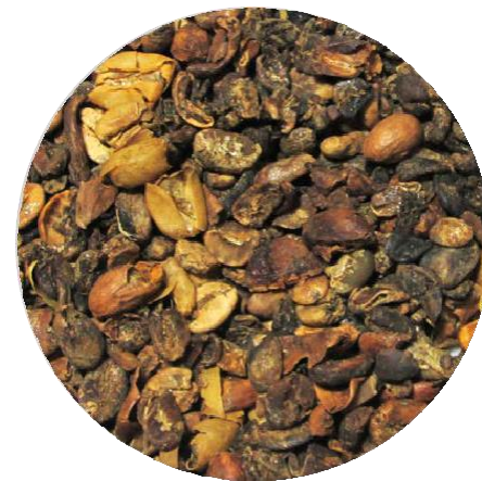
Mandheling Low Grade