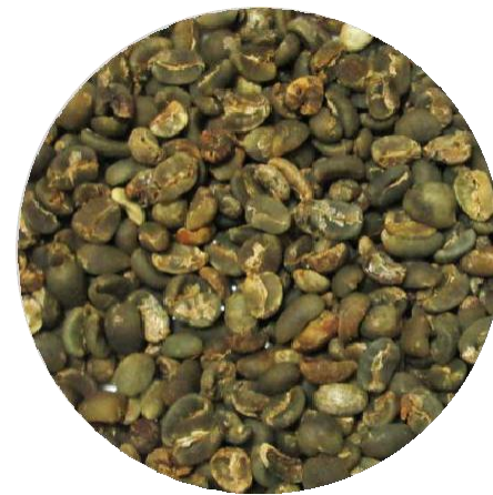
Mandheling Grade 2