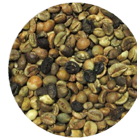
Lampung Grade 4