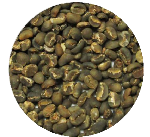
Flores Grade 1