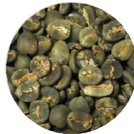
Bali Kintamani Grade 1