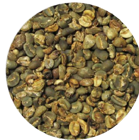
Mandheling Grade 3