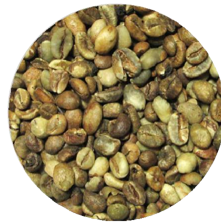
Lampung Grade 2