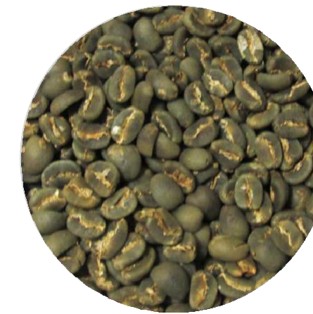
Elb Green Dino