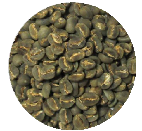
Jumbo Eighteen Plus