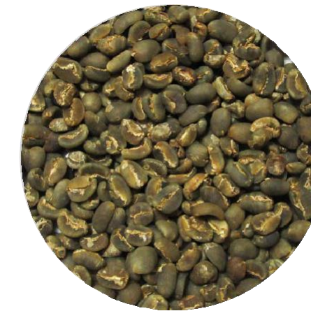
Java Preanger Grade 1