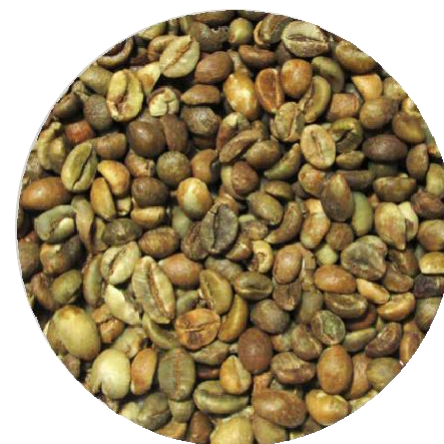
Sidikalang Grade 2