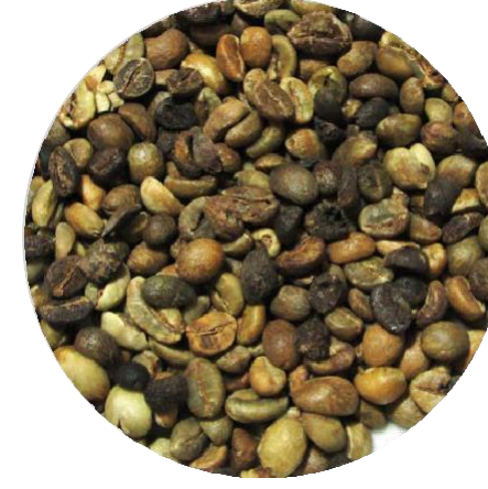
Sidikalang Grade 4