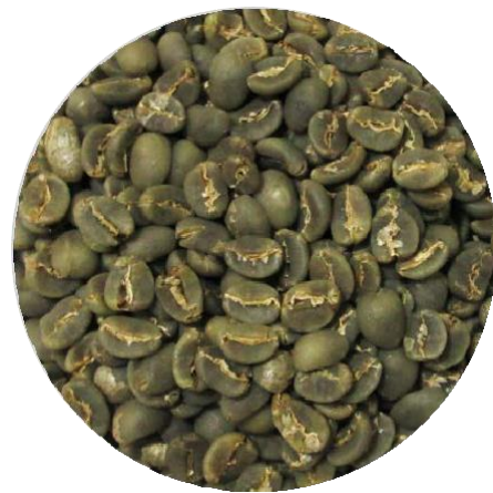
Aceh Gayo Grade 2