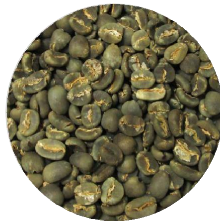
Mandheling High Grade