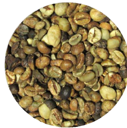
Lampung Grade 3