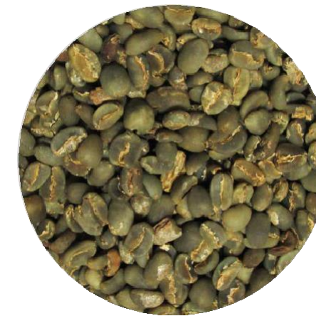
Kalosi Grade 2