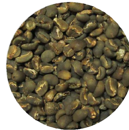
Toraja Grade 1