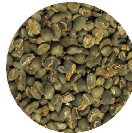
Kalosi Grade 2