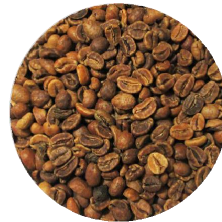
Gayo And Mandheling Wine