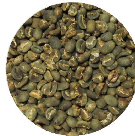
Lintang Grade 1