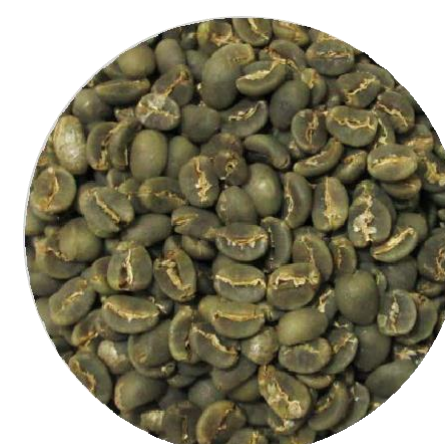
Aceh Gayo Grade 1