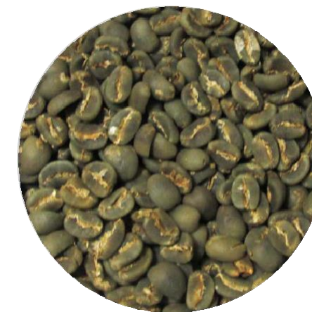
Elb Green Dino