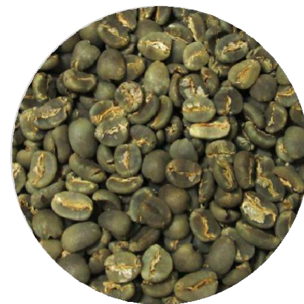
Mandheling High Grade