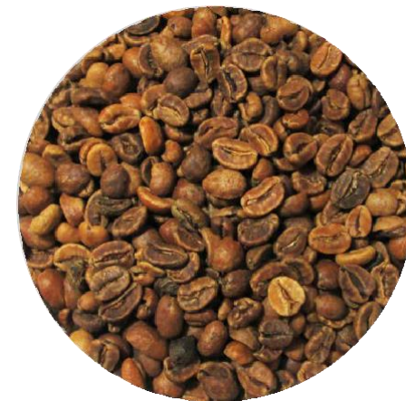
Gayo And Mandheling Wine