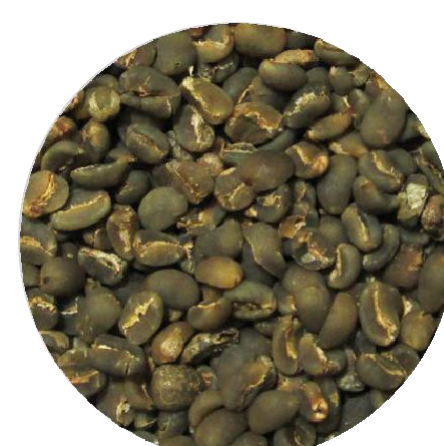
Toraja Grade 2