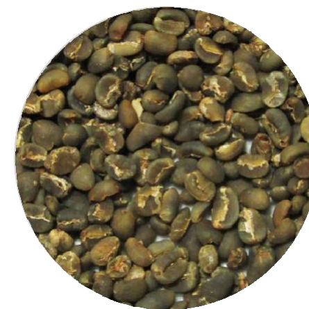
Flores Grade 1