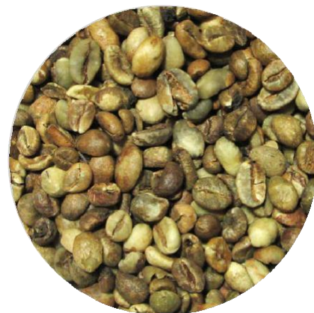
Lampung Grade 2