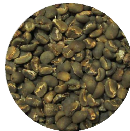
Toraja Grade 1