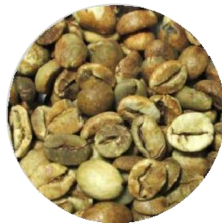
Bali Kintamani Robusta ELB 350BC